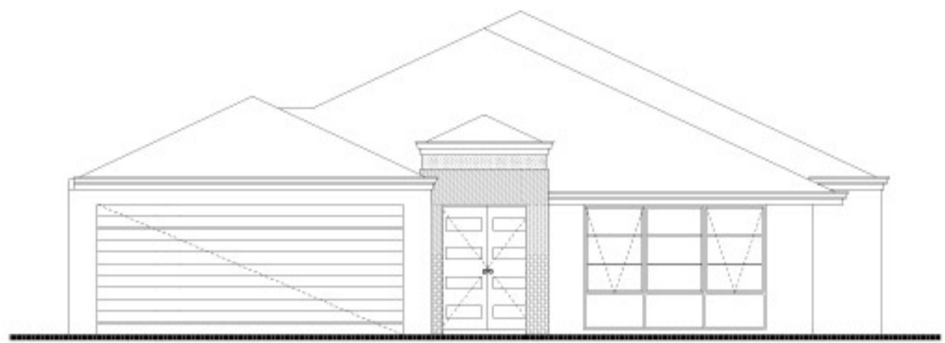
ELEVATION FOR ILLUSTRATION PURPOSES ONLY