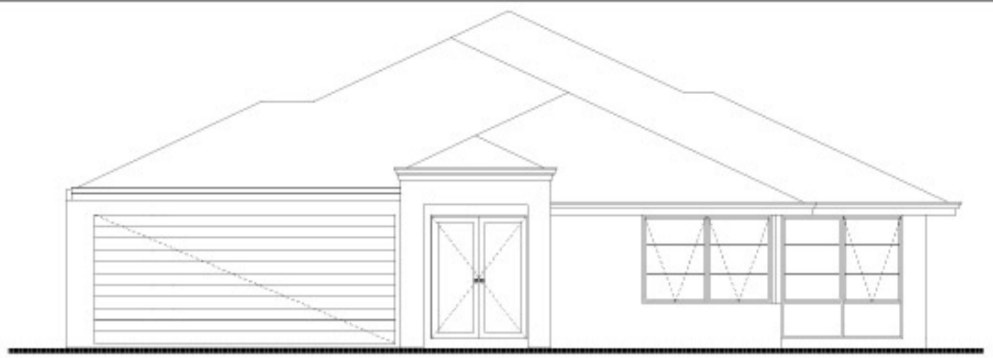
ELEVATION FOR ILLUSTRATION PURPOSES ONLY