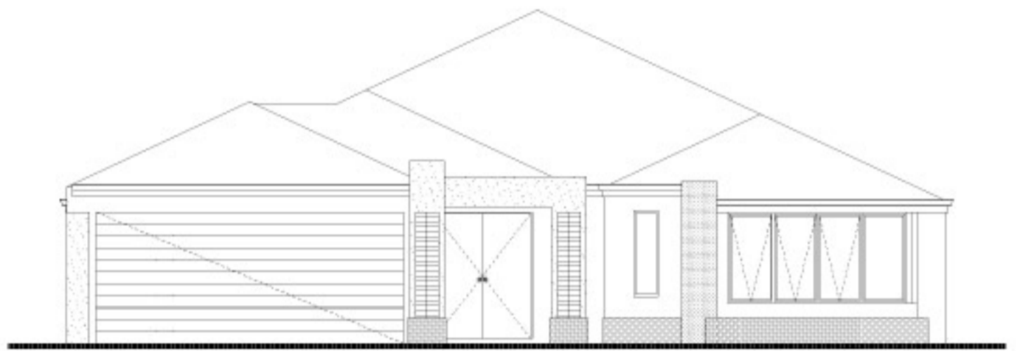
ELEVATION FOR ILLUSTRATION PURPOSES ONLY