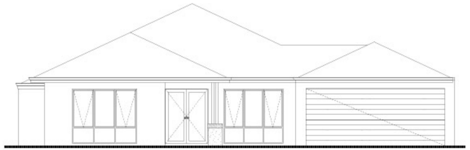
ELEVATION FOR ILLUSTRATION PURPOSES ONLY