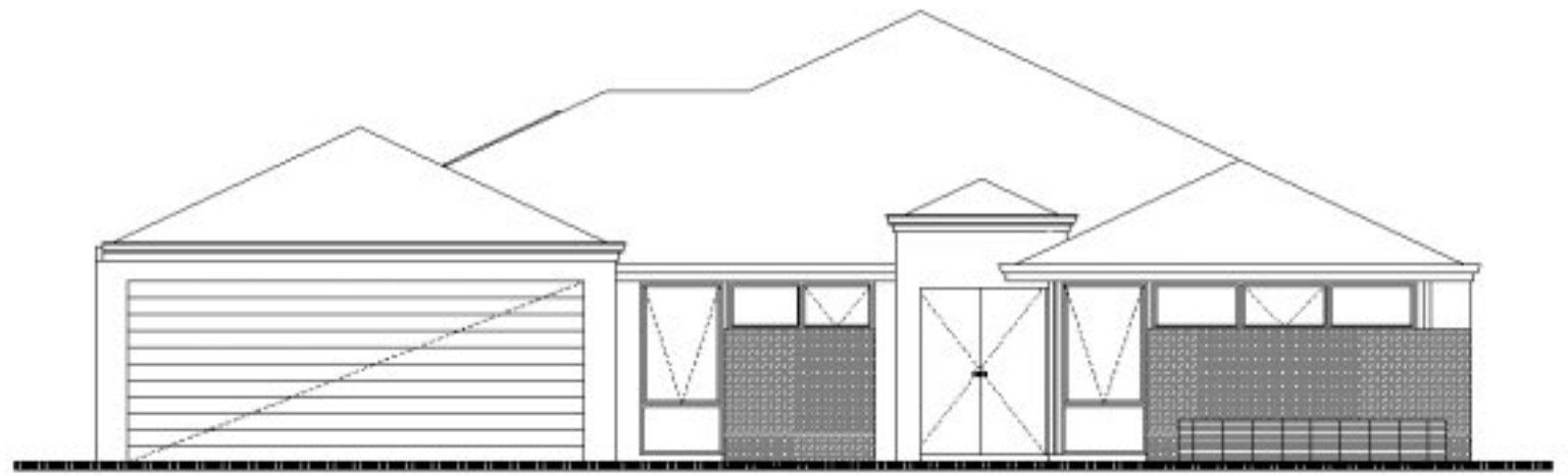
ELEVATION FOR ILLUSTRATION PURPOSES ONLY