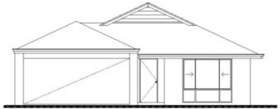
ELEVATION FOR ILLUSTRATION PURPOSES ONLY